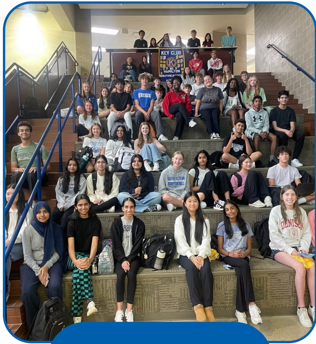
HSE Key Club!